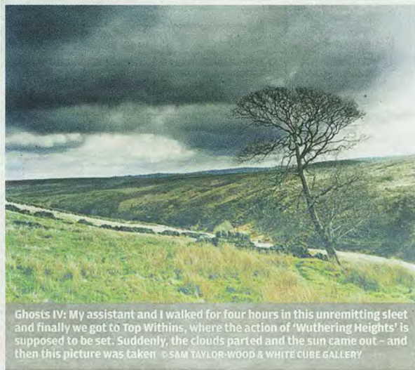
Ghosts IV: My assistant and I walked for four hours in this unremitting sleet and finally we got to Top Withins, where the action of 'Wuthering Heights' is supposed to be set. Suddenly, the clouds parted and the sun came out - and then this picture was taken © SAM TAYLOR-WOOD & WHITE CUBE GALLERY