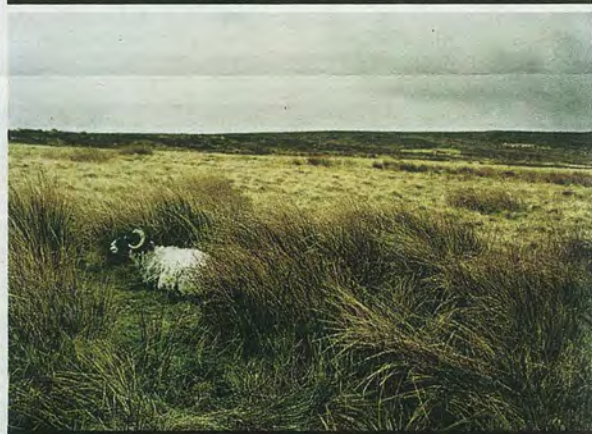
Ghosts X: There is something about the vulnerability of the ram sheltering in among the grass and the landscape. I'd taken a photo of a ram called 'Bound Ram' a few years ago, so it felt like a continuation of a minor theme