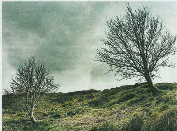
Ghosts II: This picture of two leafless trees is one of the ones I call 'Cathy and Heathcliff' to myself. It feels like their roots are intertwined and they are inhabiting the same land. But everything is rumbling on beneath the surface and those two solitary figures are standing opposed to each other